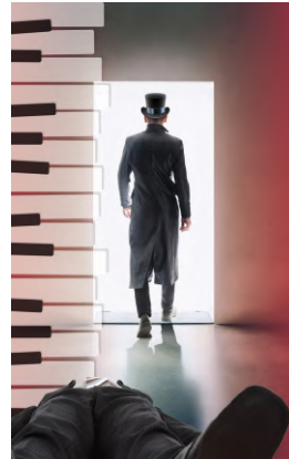
A Gentleman's Guide to Love and Murder April 27th - May 7th

For more information on our upcoming shows, and to reserve tickets, please visit our website: